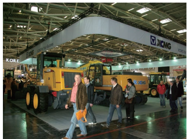
XCMG exhibited its large agricultural machinery on the Import Show on German Construction Machinery and Technology 2008.