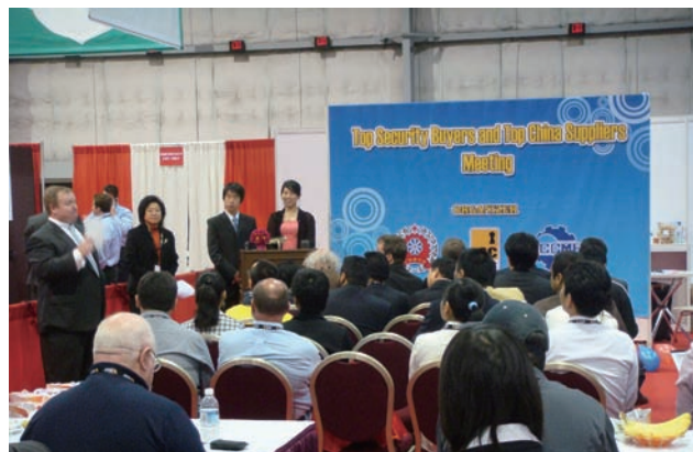
Top Security Buyers and Top China Security Suppliers Meeting in ISC WEST 2009, Las Vegas, USA