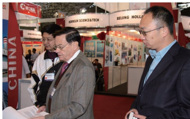
Exhibitors from SUMEC Machinery & Electric Co., Ltd. introduce their export products to the representatives of ABIEE.