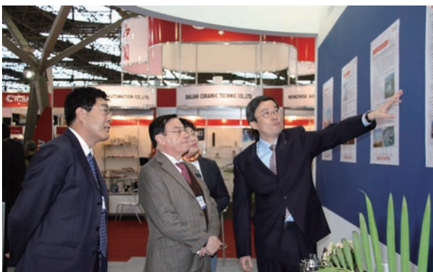
On the International Electrical, Energy and Automation Industry Trade Fair held in 2009, exhibitors from Shandong Electric Power Design Institute introduce their institute to representatives of Brazilian Electrical and Electronics Industry Association (ABIEE).