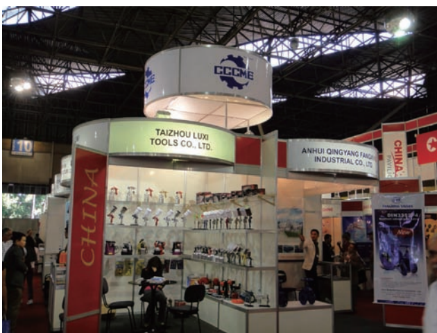
CCCME organized Chinese exhibitors to attend the Mekanica 2010