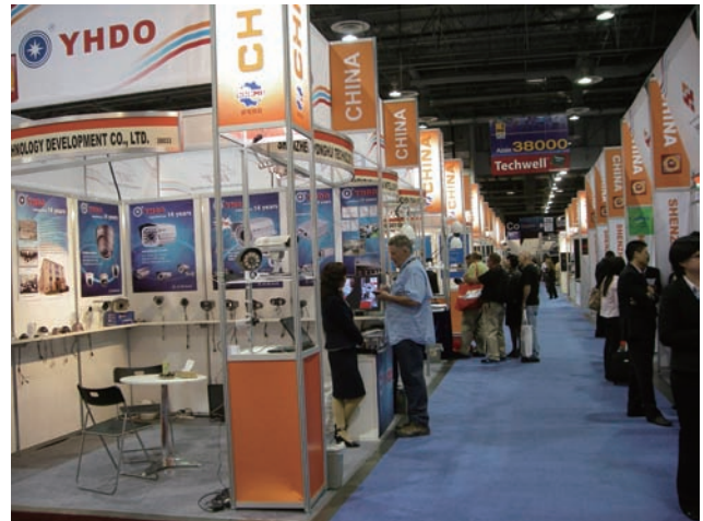
ISC WEST 2010 in March 2010