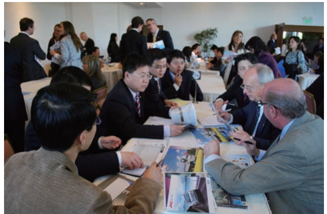
CCCME and Peru China Chamber of Commerce (CAPECHI) jointly held China-Peru Trade and Investment Promotion Forum.