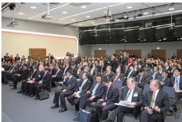
On May 19, 2010, Sino-Austria Economic and Trade Cooperation Forum & Contract Signing Ceremony was jointly held by CCCME and Austrian Federal Economic Chamber in Vienna, Austria.