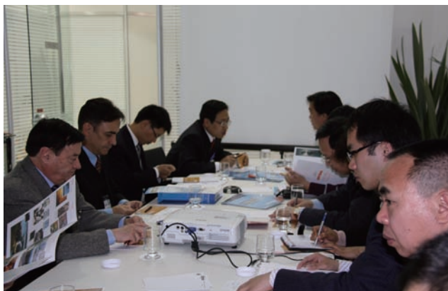
Representatives of ABIEE talks with the exhibitors organized by CCCME.