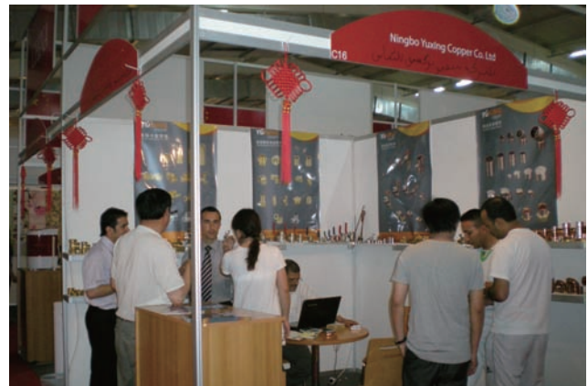
On the 43rd Algiers International Fair, our exhibitor has a business talk with purchasers.