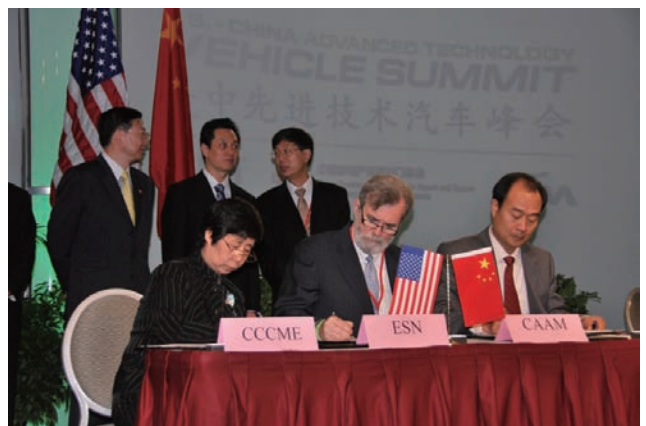
US-China Advanced Technology Vehicle Summit & Contract Signing Ceremony was jointly held by CCCME, China Association of Automobile Manufacturers and Energy Systems Network (US) in Indianapolis, US on May 28, 2010.