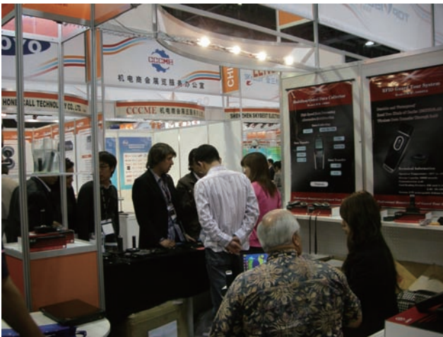
Business talks between the exhibitors and buyers in ISC WEST 2010 in March 2010