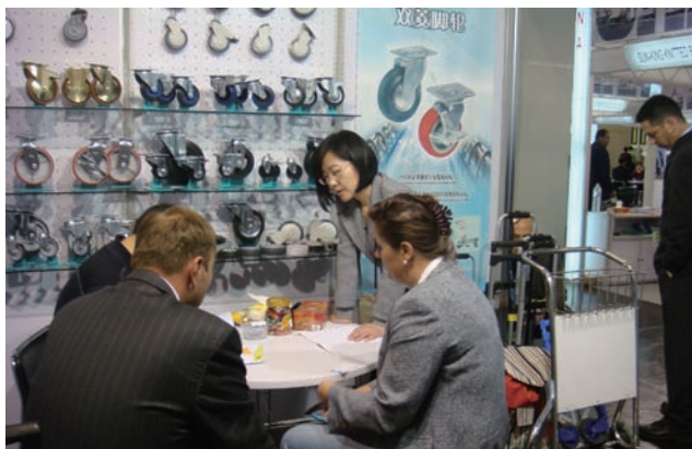
On the International Hardware Fair Cologne 2010, exhibitors organized by CCCME have a business talk with foreign visitors.

Some photos taken in the major exhibitions held or participated by CCCME are as follows: