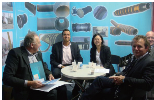
On the EuroPort 2009, our exhibitor has a picture taken with the visitors before their business talk.