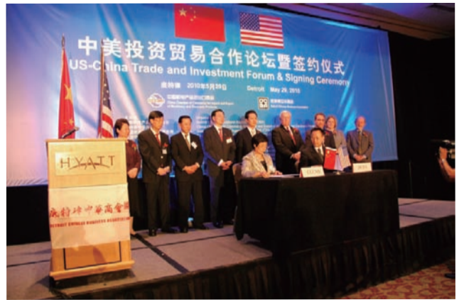
CCCME and Detroit Chinese Business Association jointly held SINO-US Investment and Cooperation Forum & Contract Signing Ceremony in Detroit, US on May 30, 2010.